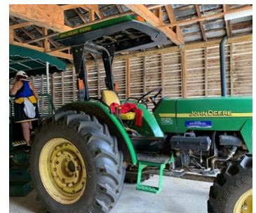
WAGON RIDE AROUND THE FARM