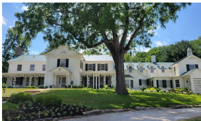
THE BIG HOUSE

I developed a deep sense of respect for Bromfield. In his day he was the country's most famous author, one of the earliest farmer conservationists, and most definitely a visionary. His life was fascinating, from his childhood near Mansfield, to his studies at Cornell and Columbia, to his years in France before and during WWII, and finally to his return to Ohio where his family had been one of the earliest white settlers and farmers (from the Society of Architectural Historians).